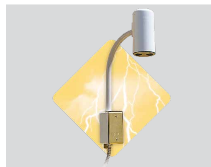
Vaisala ALARM displays electric field intensity measurements from up to 7 Vaisala electric field mills