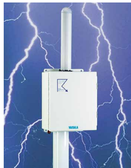
Vaisala ALARM displays cloud and cloud-to-ground lightning information from Vaisala local lightning Thunderstorm Sensor